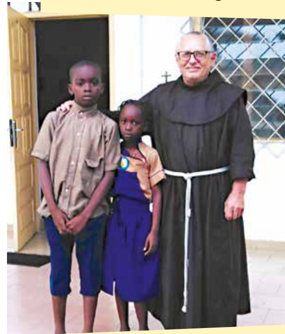
The brother and sister welcomed to the Center during the lockdown.