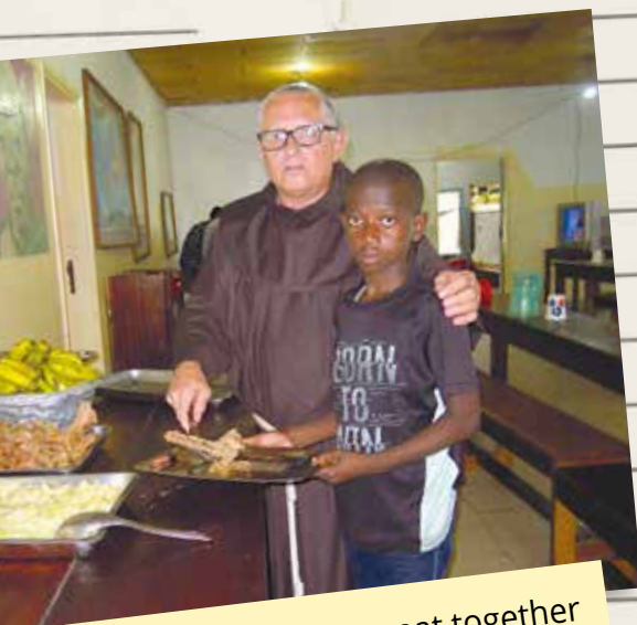
Children and teenagers eat together with the friars in the refectory.

a.m. 19 In the chapel we recite prayers together and then... everyone at the table! Usually our talented cook prepares it, but on Sundays, which is her day off, the older kids cook for everyone and look after the younger ones. For them, it is an opportunity to grow and learn to live together as brothers and sisters!