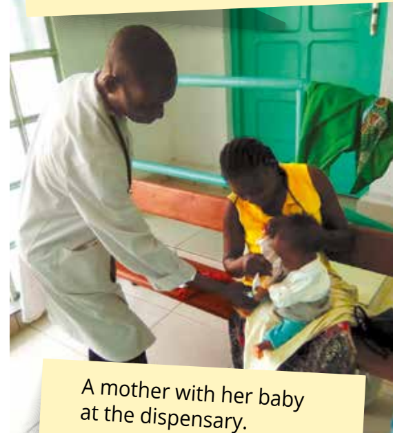
A mother with her baby at the dispensary.

Your generosity is home, care and hope for the lonely children of Congo Brazzaville