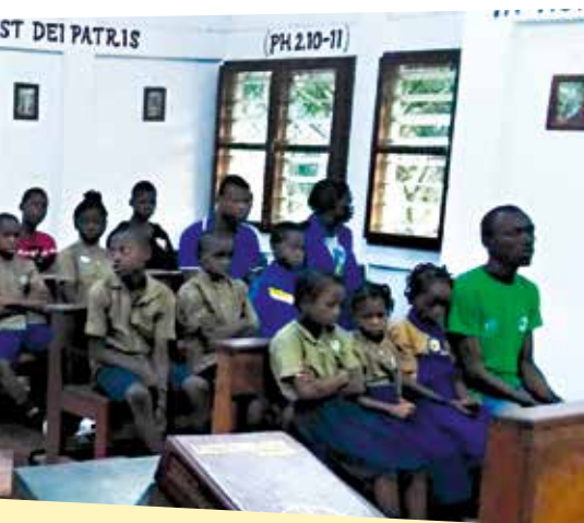
A moment of prayer together in the chapel of the Center.

Among the latest arrivals, there are a brother and sister whom the police brought to us during the