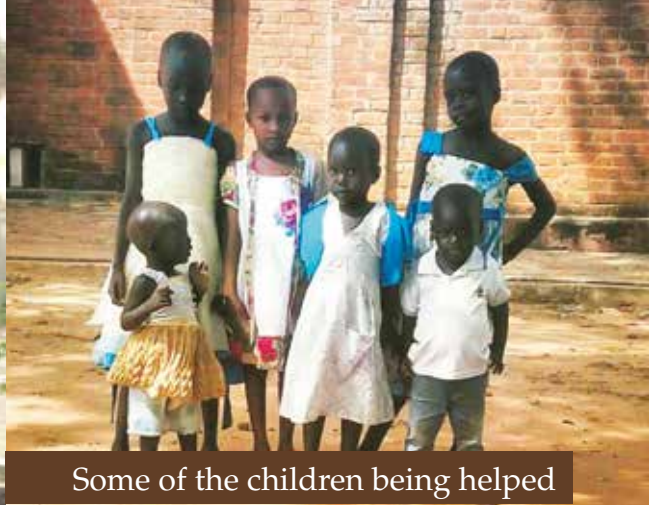
Some of the children being helped

PROVIDING CARE, SHELTER AND SCHOOLING FOR THE POOREST PEOPLE IN JUBA.